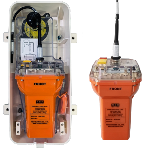
EPIRB with Float-Free Enclosure