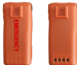
Battery Emergency / Rechargeable