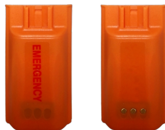
Battery Emergency / Rechargeable